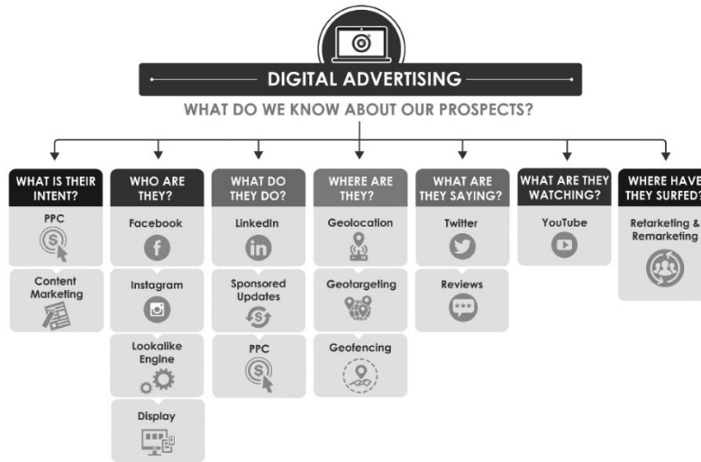
Figure 9: What Do We Know About Our Prospects?

These days, nobody is truly “off the grid” because everybody has a smartphone, which essentially doubles as a tracking device. With geotargeting—a power you can harness by using various advertising platforms and tools—you can also determine where your prospects are located.